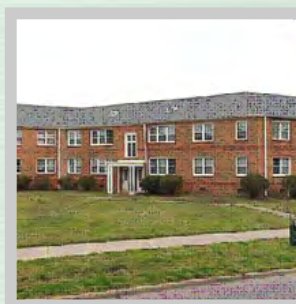
$21.3MM Renovation Richmond, VA