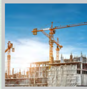
$30MM New Construction Los Angeles, CA