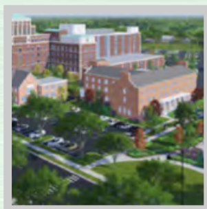
$34.5MM Adaptive Reuse Aurora, IL