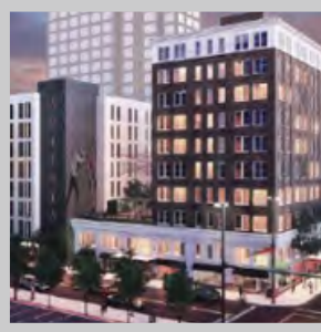
$19MM Mixed Use San Antonio, TX