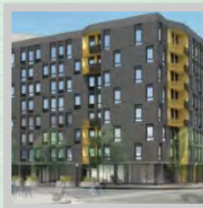
$12.4MM New Construction Boise, ID

One of the nation's most entrepreneurial lending institutions, UC Funds is closing deals, now. From new construction and development through to permanent financing, we are your One-Stop shop. Call Today: 844-UC-Funds