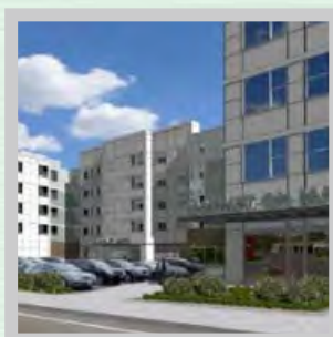
$10.5MM Acquisition Weymouth, MA